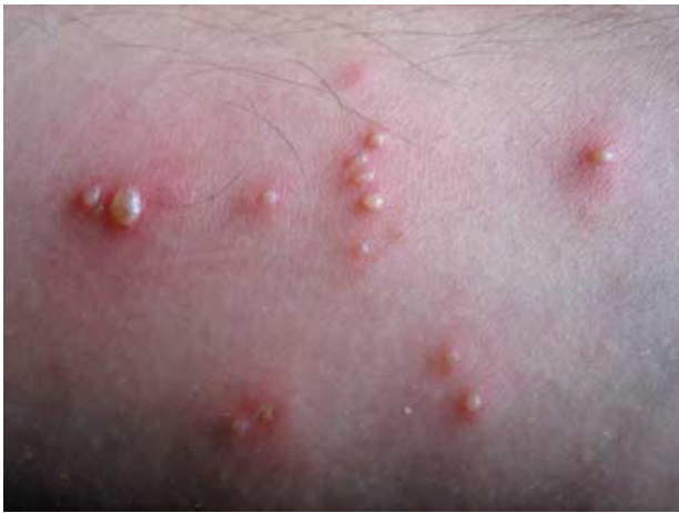
Figure 2. Posterior aspect of the arm of one of the authors (LGC) subjected to an experimental fire ant sting. Note the pustules and erythema 24 h after the sting.