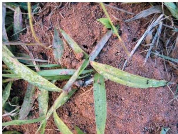
Figure 1. Fire ant anthill. After a mechanical insult, several fire ants leave the anthill.

Ants are insects belonging to the order Hymenoptera and superfamily Formicoidea that exhibit a complex social structure. There are many families and genera of ants around the world, but only a few species cause injuries with important repercussions in humans. The Solenopsis spp. are of the most important medical interest. Two species are found in Brazil: Solenopsis invicta , known as red fire ants, originally from the Pantanal (the Brazilian swampland, located in the mid-west region of the country).