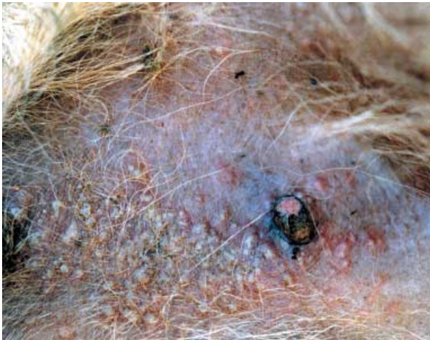
Figure 3. Abdominal region of the dog stung by fire ants. Several grouped yellow nonfollicular pustules and several fire ants attached to the skin.

skin lesions in an otherwise healthy dog. Several grouped, nonfollicular, circumscribed yellow pustules were present on the ventral abdominal and inguinal areas (Fig. 3). On close observation, the pustules were relatively tense, surrounded by a slight erythematous halo, and several dead fire ants were attached to the skin and hairs. Pruritus, pain or discomfort was noted neither during physical examination nor by the owner. There was no history of previous drug administration. The differential diagnoses were pustular dermatitis caused by fire ant stings, impetigo, superficial bacterial folliculitis, dermatophytosis, demodicosis, subcorneal pustular dermatitis, and pemphigus foliaceus.