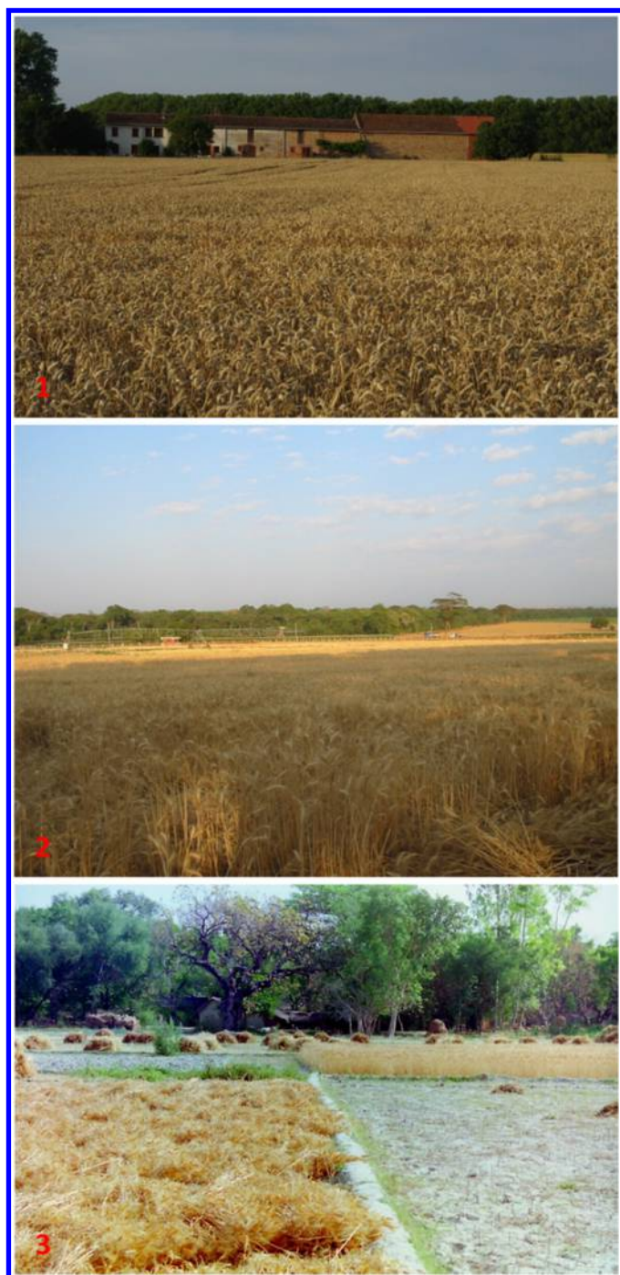
Fig. 2. Illustrations for three wheat-based agrosystems. Agrosystem 1 (top): small intensive farm, temperate agriculture; Agrosystem 2: extensive large farm; and Agrosystem 3 (bottom): semiarid or transition climate farm.

Agrosystem 3 is adapted to climatic conditions that are marginally favorable for wheat cultivation. This is compensated by comparatively much higher agricultural labor availability and well-adapted technologies, including crop husbandry and germplasm. Because of the food demand that population growth generates locally or regionally, Agrosystem 3 expands in areas where conservation agriculture may dominate. This setting is very strongly exposed to climate change, with high risks of drought and heat waves (IPCC 2014). Chemical inputs nevertheless increase slightly, especially in the form of mineral fertilizers. Host plant resistances remain the main instrument of disease control.