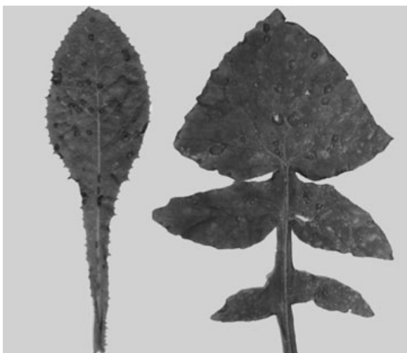
Fig. 2 Adaxial side of leaves of Sonchus oleraceus (right) and Sonchus asper (left) showing leaf-spot symptoms caused by Alternaria cichorii