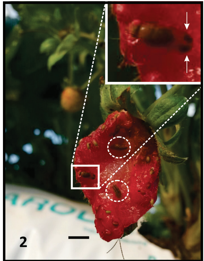
Fig. 2. Damaged strawberry in the field with drosophilid flies including a Drosophila suzukii male (inlet) with its characteristic wing black dots (arrows) and 2 adults of Zaprionus indianus (white circles), scale bar = 5 mm.

We thank the CAPES Foundation, the National Council of Scientific and Technological Development (CNPq), the Minas Gerais State Foundation for Research Aid (FAPEMIG), and the Arthur Bernardes Foundation (FUNARBE) for grants provided to this work.